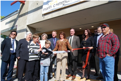
Ribbon cutting for the new Novato Community Clinic at 1600 Novato Boulevard

One bright spot in these otherwise trying times is the recent opening of the Marin Community Clinics’ new Novato facility, which moved into new and larger quarters at 1600 Novato Boulevard. This move not only accommodates more patients and services at a time where demand is